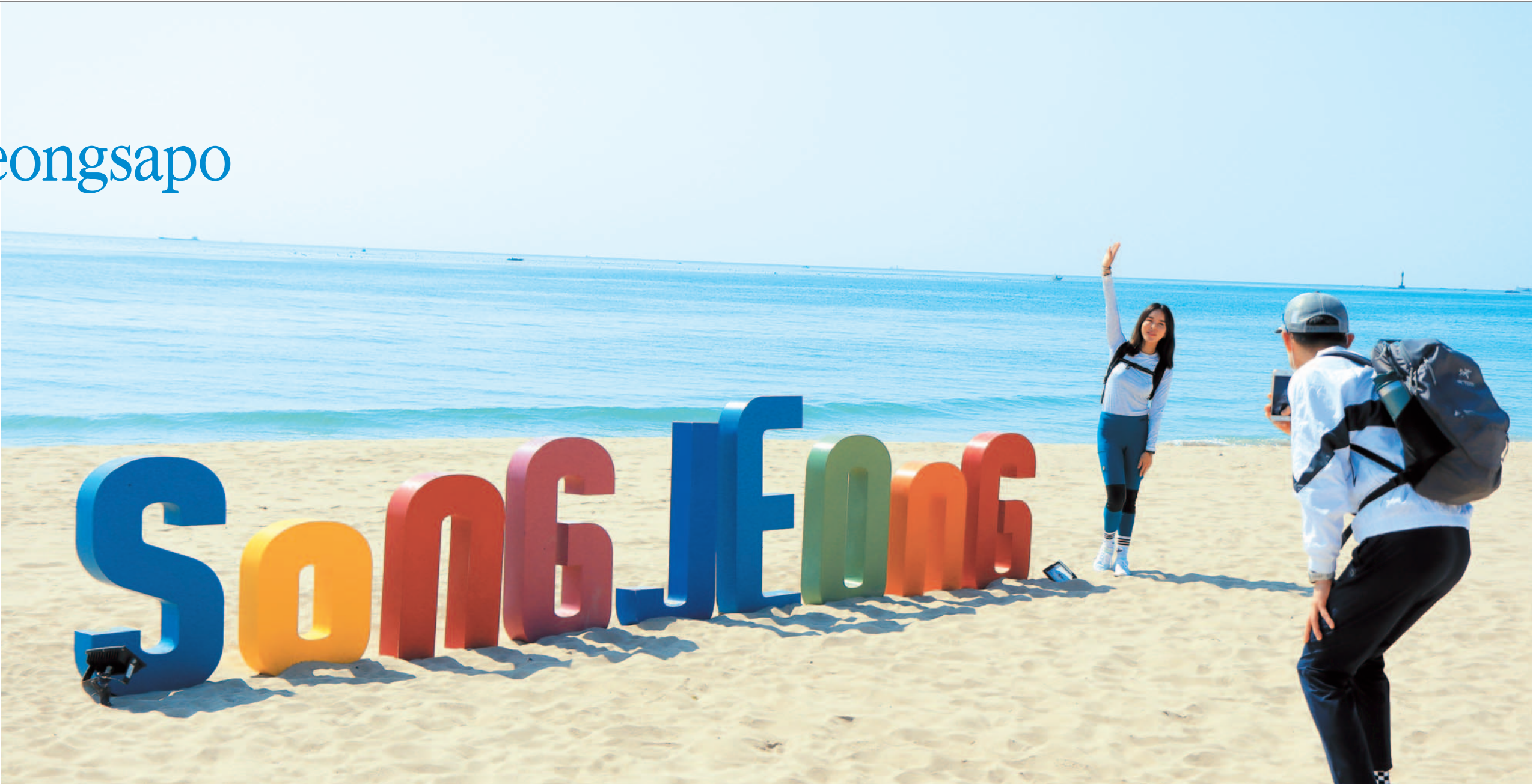
Songjeong Beach is Busan's surfing hotspot and is very popular with families and friends alike for a great day at the beach.

Songjeong Beach is the perfect city summer getaway. Whether it's to enjoy sunbathing on its vast shore, to discover the many food options nearby or to take a surfing lesson, there are plenty of reasons to pay this beach a visit. One of the most marvelous things to explore from Songjeong is the Dullegil trail, which sets your eyes upon blue skies, sparkling water and green forests.