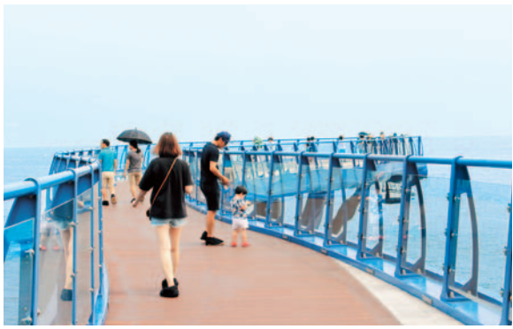
The Cheongsapo Daritdol Observatory is a must-visit.