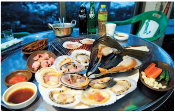
Chow down on the freshest seafood in the city in Cheongsapo.