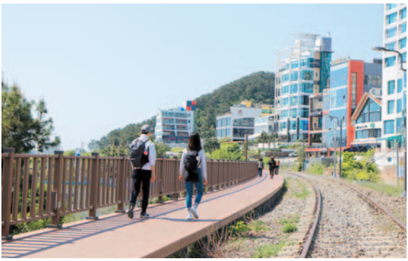
Scenic train tracks guide you along your way.

Songjeong Beach is the perfect city summer getaway. Whether it's to enjoy sunbathing on its vast shore, to discover the many food options nearby or to take a surfing lesson, there are plenty of reasons to pay this beach a visit. One of the most marvelous things to explore from Songjeong is the Dullegil trail, which sets your eyes upon blue skies, sparkling water and green forests.