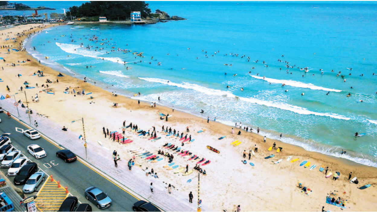
Whether you go surfing or swimming, Songjeong Beach has everything you need for a great summer day.

Songjeong Beach is smaller than both Haeundae and Gwangalli, but it's popular with surfers and is the start of your day. The trek from Songjeong to Cheongsapo begins with a charming set of train tracks that stretch all the way to Haeundae Mipo. They set out from the old Songjeong Station, which is no longer operational, and they provide the setting for one of the best places in Busan to take fun and beautiful selfies and photos with friends.