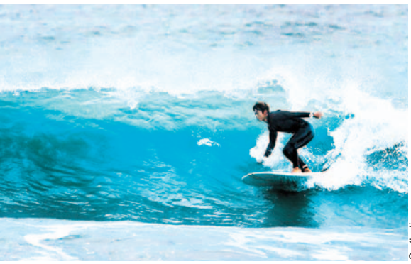
Learn how to surf at Surfholic in Songjeong.